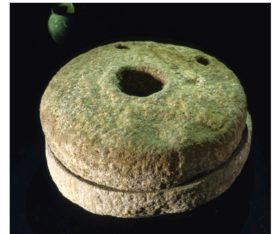
A quern stone, for grinding grain to make flour. You poured grain in at the top, used a wooden handle to turn the top stone, and collected the flour ground between the stones. (BBC Website)