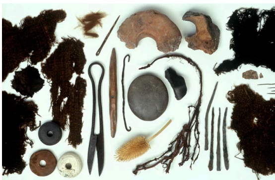
These are fragments of Viking cloth and weaving tools. The tools include needles and shears. The textiles still have traces of coloured dyes.